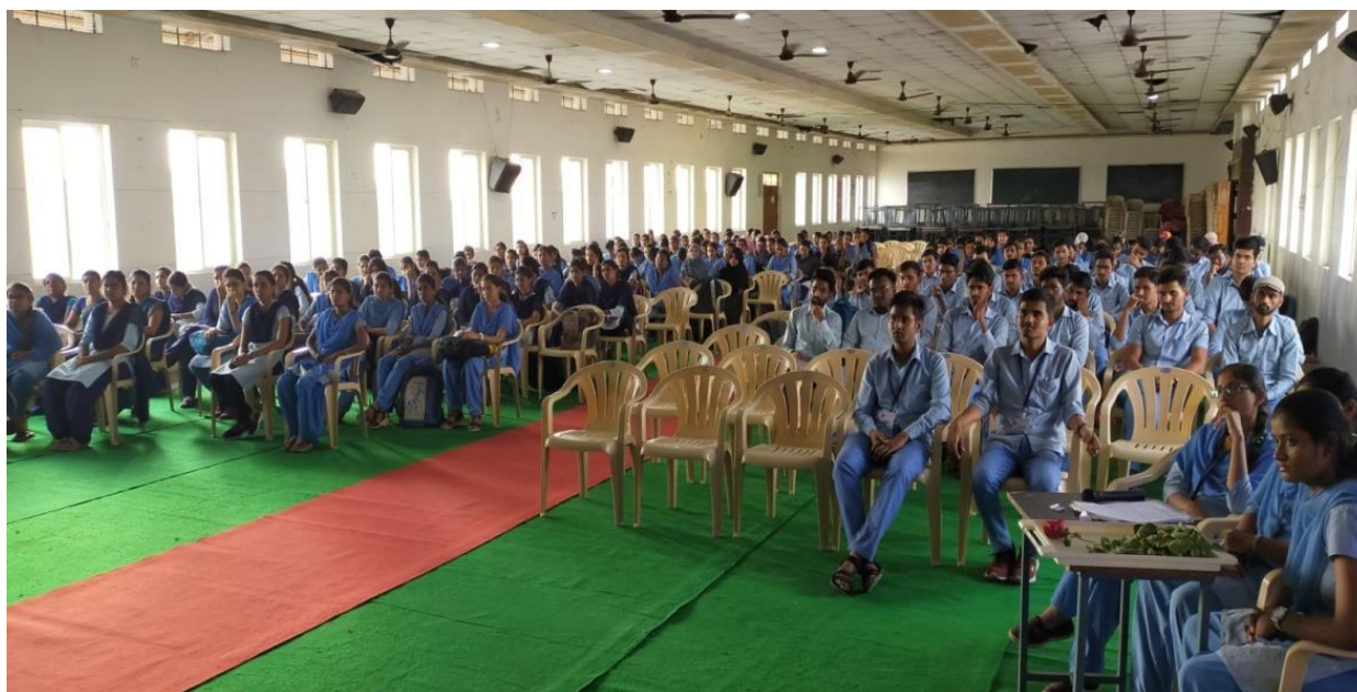
Participants of the Quiz Competition