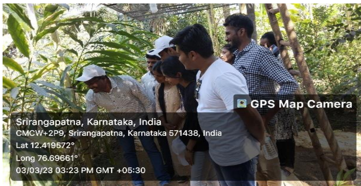
Visit to Kerala Spices and Ayurvedic Garden, Srirangapatna.