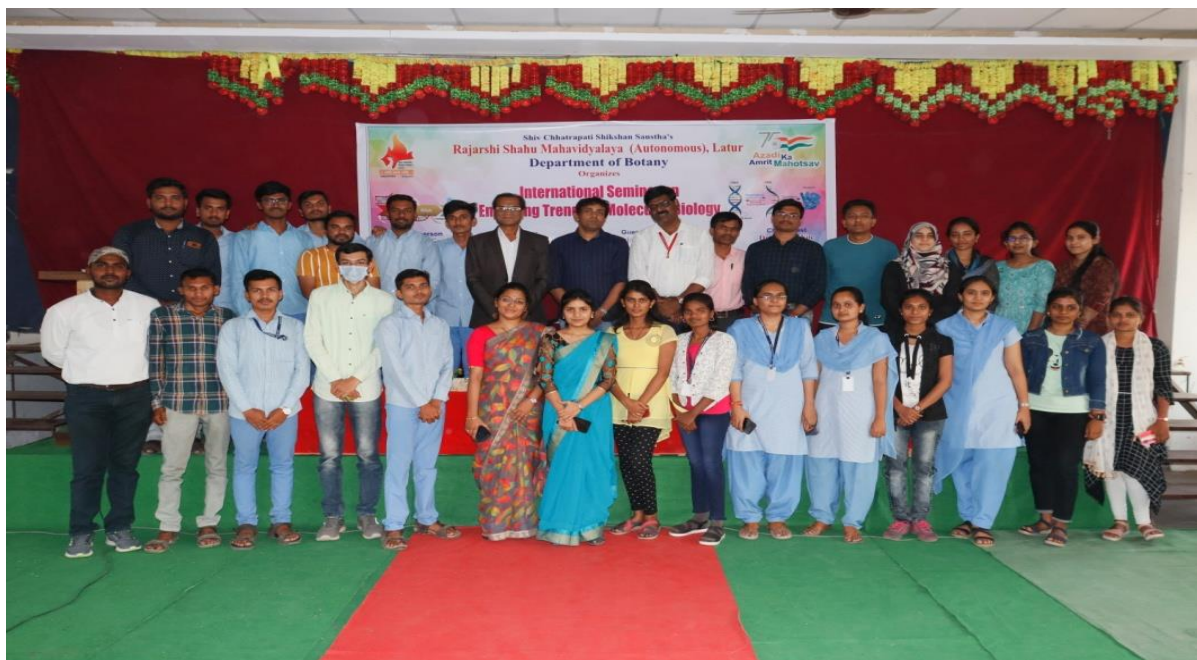
Participants involved in International Seminar on Emerging Trends in Molecular Biology