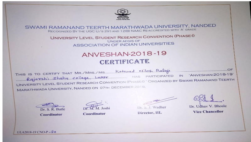
Certificate of Anveshan Phase-I 2018-19 competition (Nilesh Kotwad)