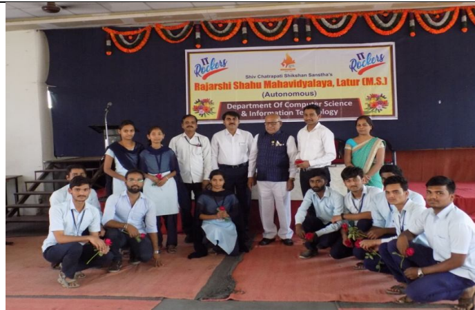
Felicitation of students who have completed Internship Programme at Sanskar IT Solutions, Nilanga by President of Shiv Chhatrapati Shikshan Sanstha, Latur.