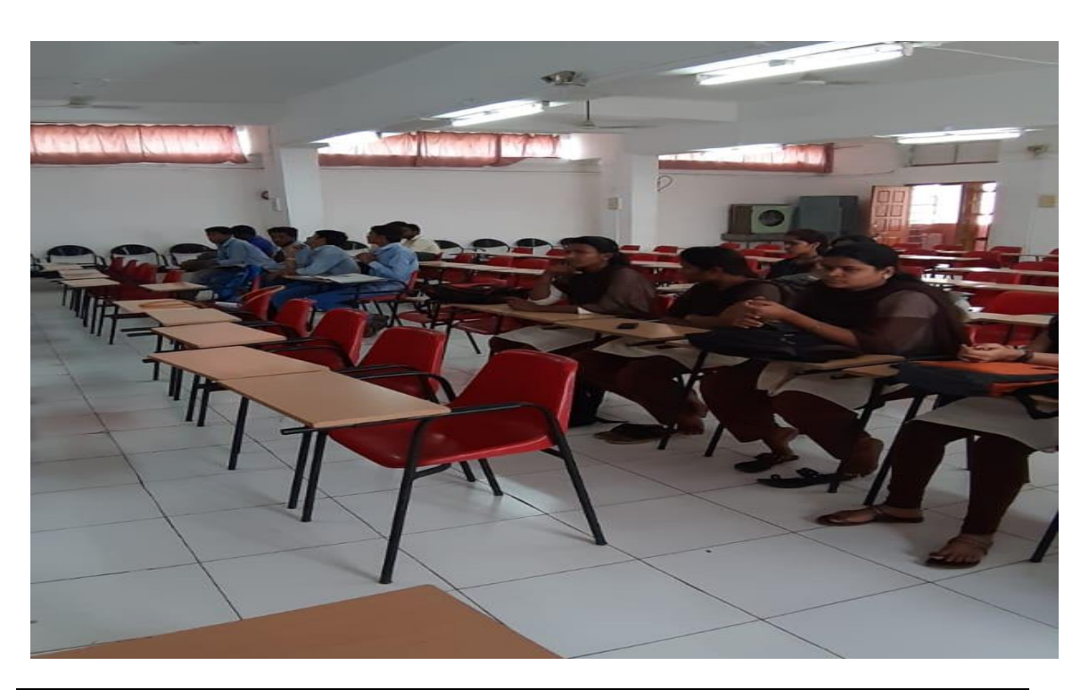
Participited students on the occasion of guest lecture of Research Methodology.