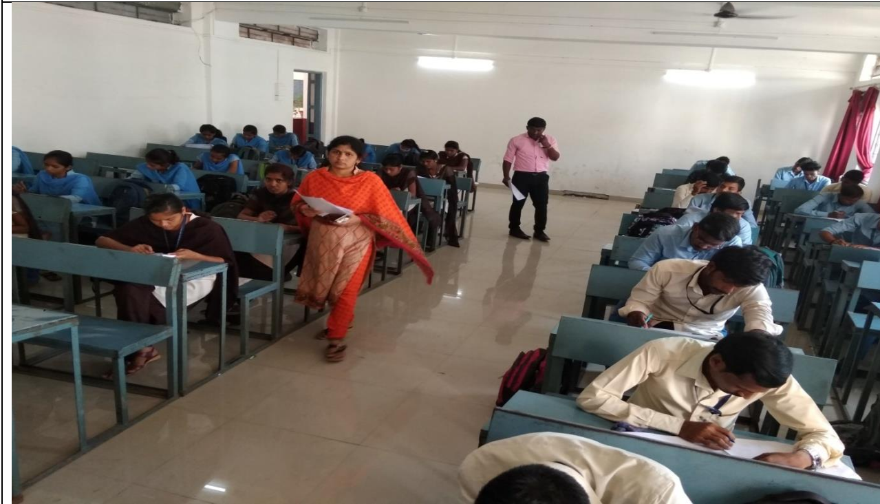
Students enthusiastically participated in this test.