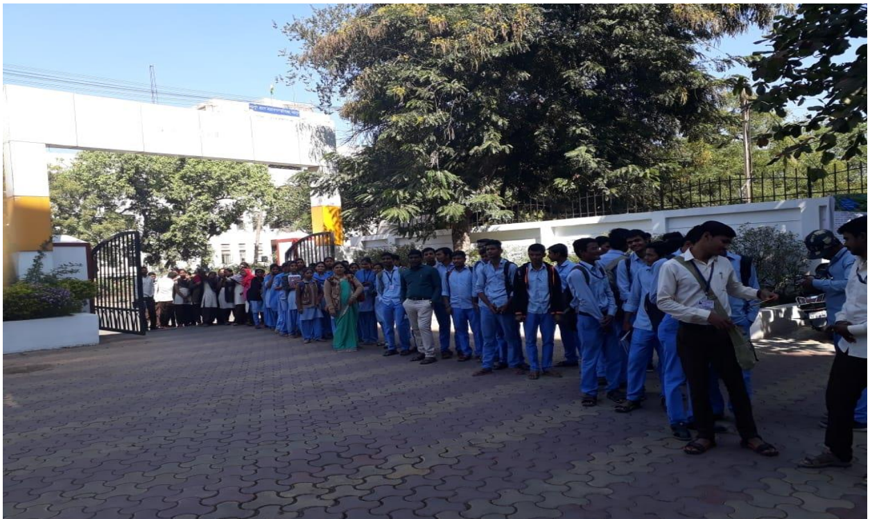
Staff Member of Economics department and Students visited of DCC Bank at Latur.