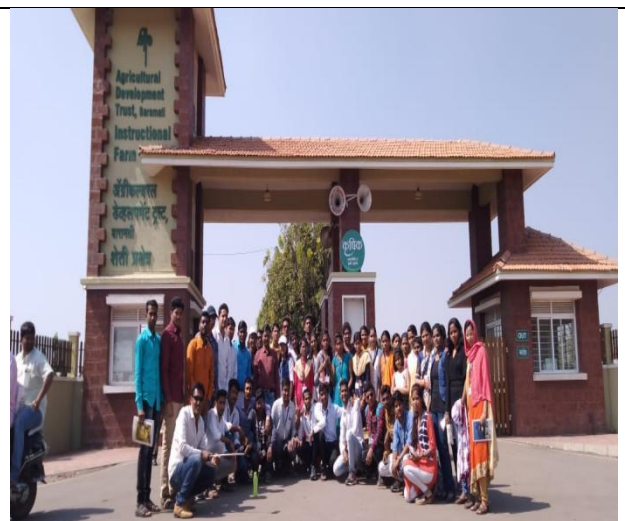
Staff Member of Economics department and Students visited of at Murud Janjira, Baramati and Mahableshwar.