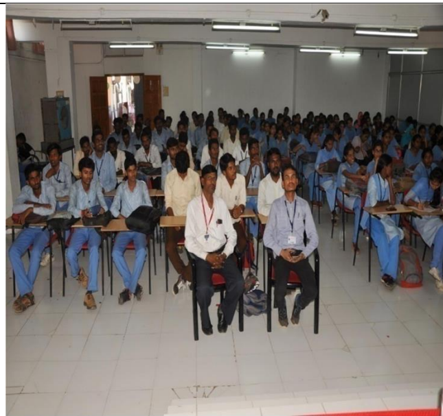
Students actively participated in this guest lecture.