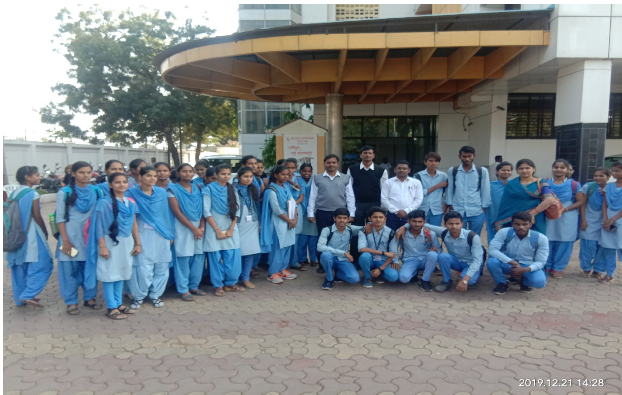
Staff Member of Economics department and Students visited of DCC Bank at Latur.