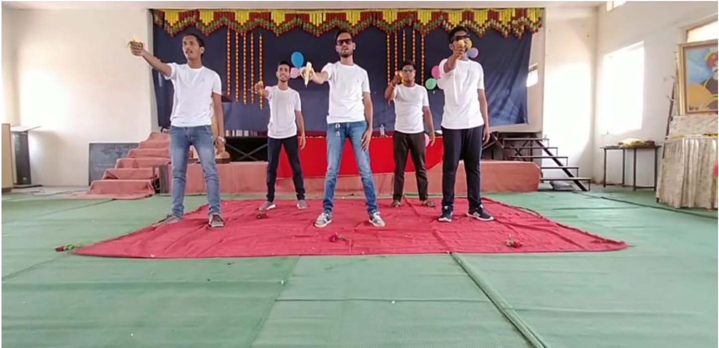
M.A.II students enjoy with western dance in this program