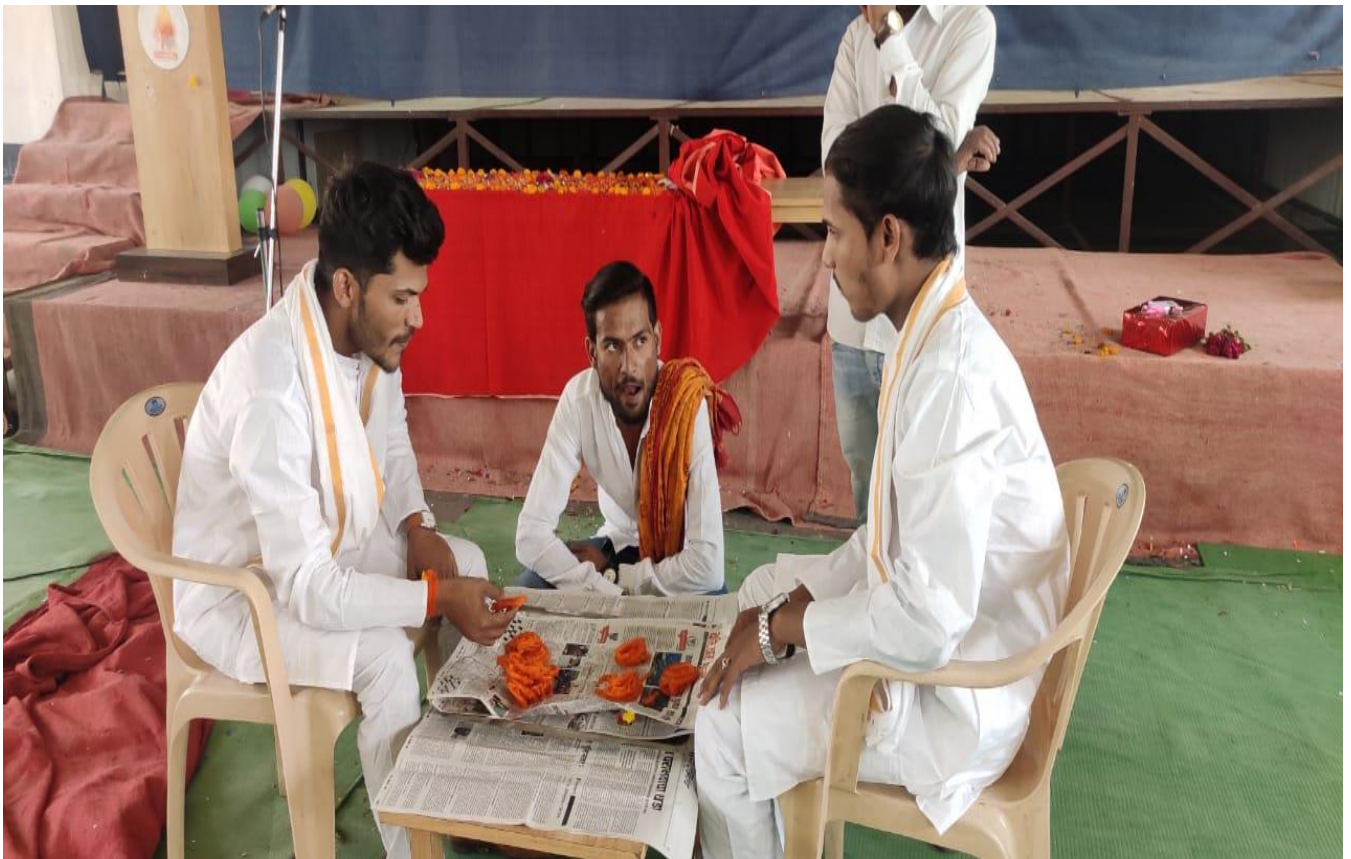
Students were enjoying in One minute show to eaten Jeelebi