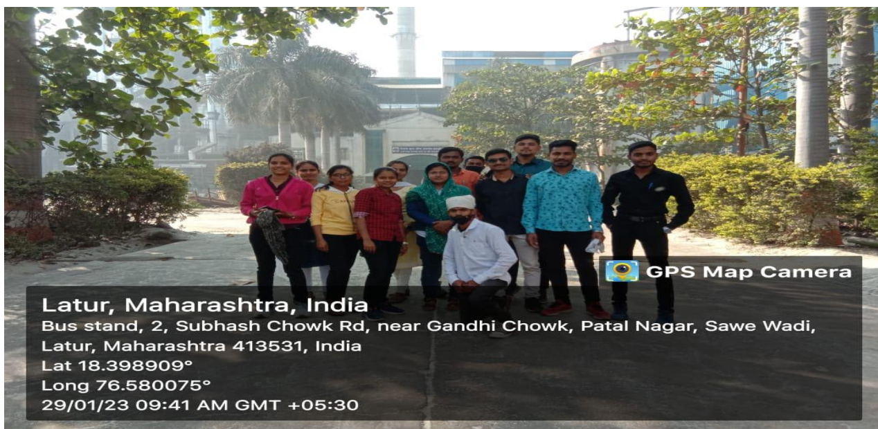
Department of Economics one day Educational Trip Students Visited at Thombre Sugar Factory Ranjani.