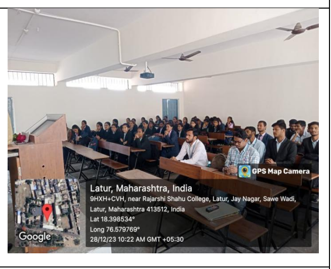
Students actively participated in this guest lecture.