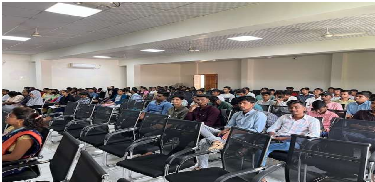
B. A. I year students were participated in Induction Programme at VLC.