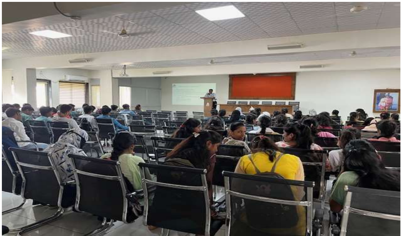
B. A. I year students were participated in Induction Programme at VLC.