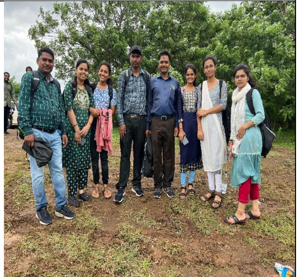
Participated students and Faculty Member of Economics department visited at Kapildhara, Dist. Beed