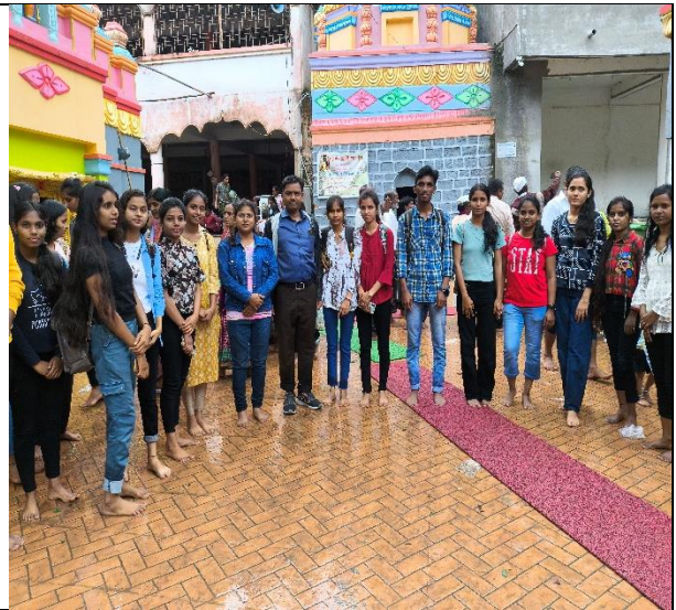
Participated students and Faculty Member of Economics department visited at Sautada, Dist. Beed.