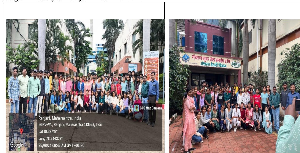
Participated students and Faculty Member of Economics department visited at Milk Industry Ranjani Dist. Dharashiv