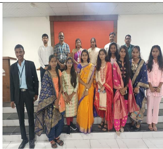
Newly Admitted students of B. A. I Year