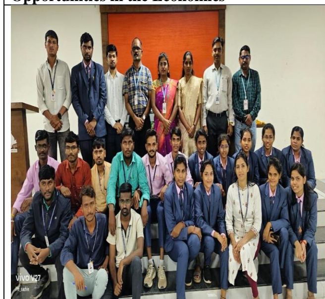
Newly Admitted students of M. A . I Year