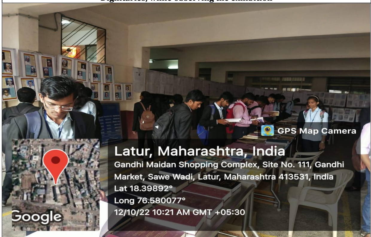
Students while visiting the exhibition