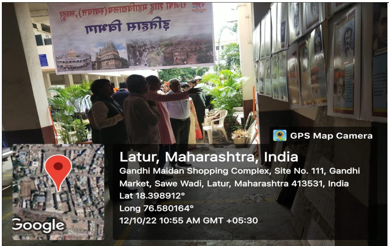
All Dignitaries, while observing the exhibition