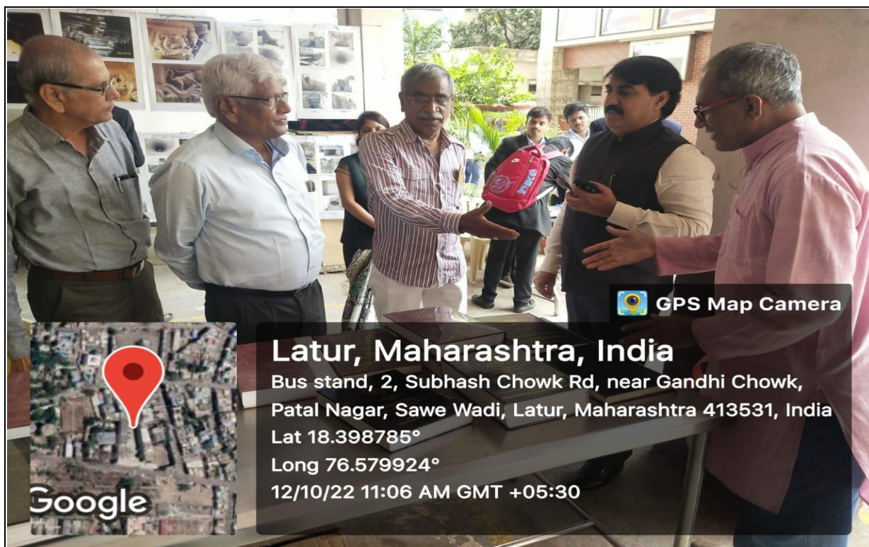
Dignitaries, while observing the exhibition