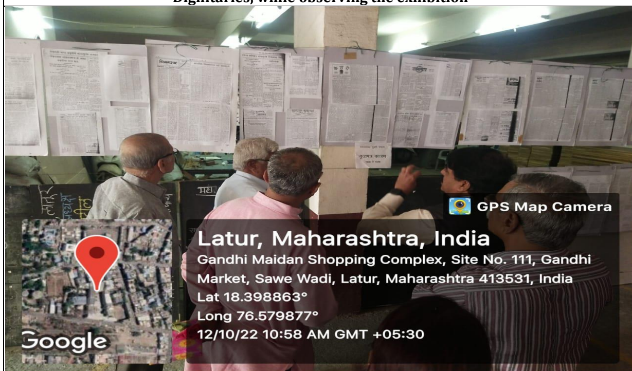
Dignitaries, while observing the rare newspapers on exhibition