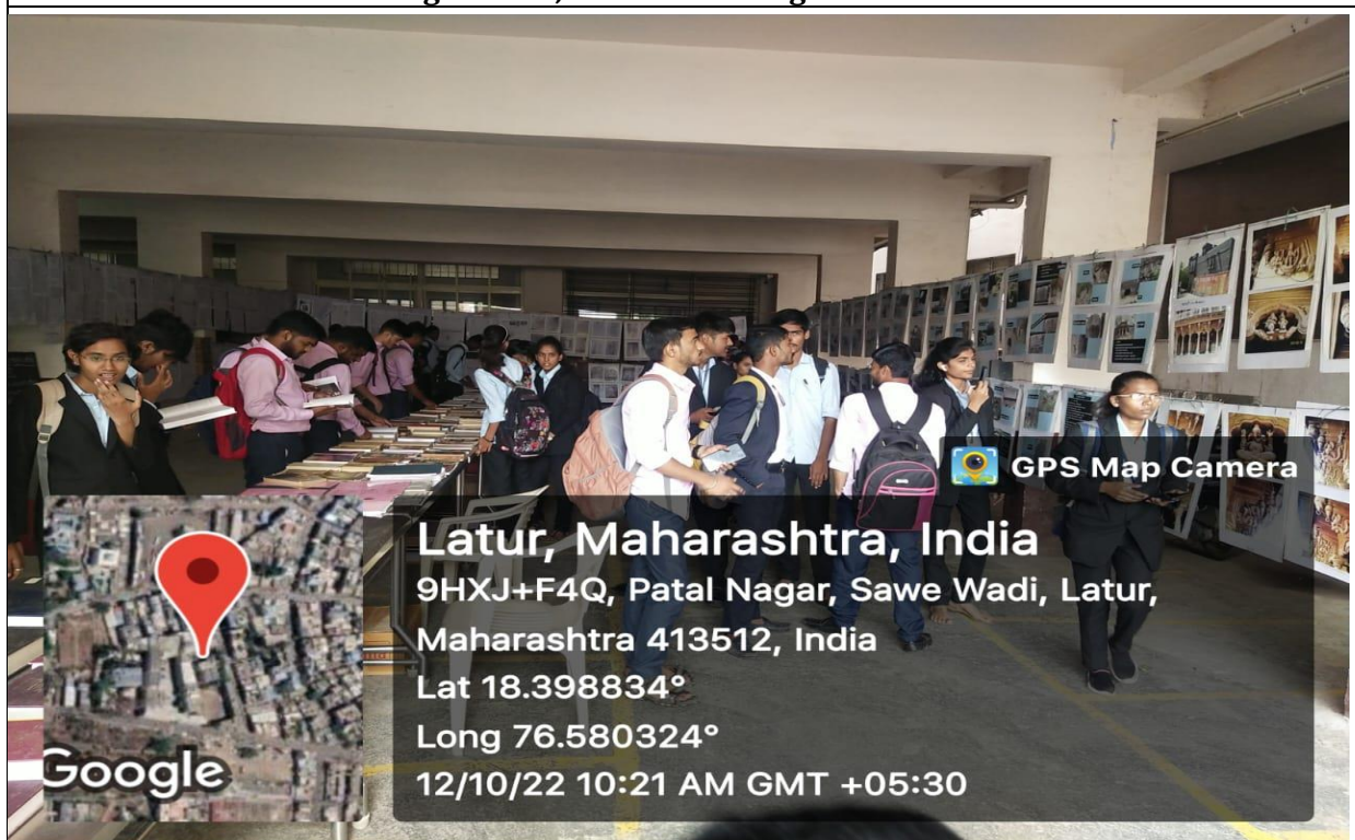
Students while visiting the exhibition