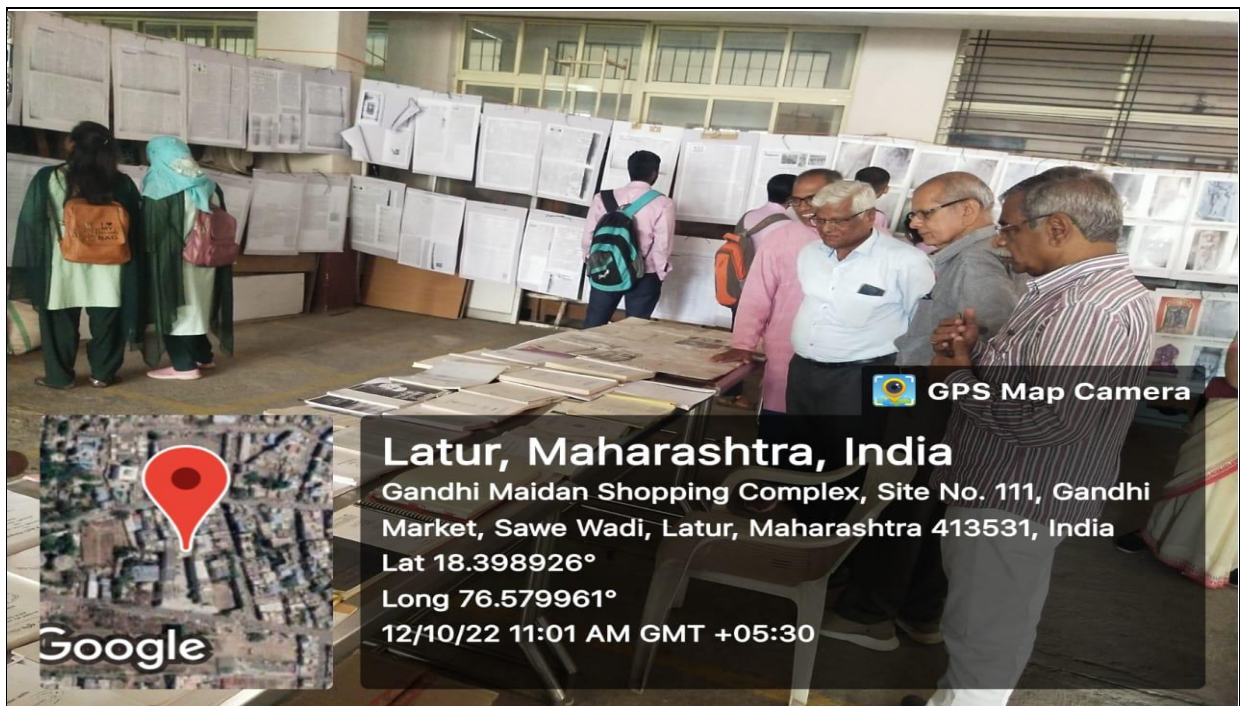
Dignitaries, while observing the exhibition