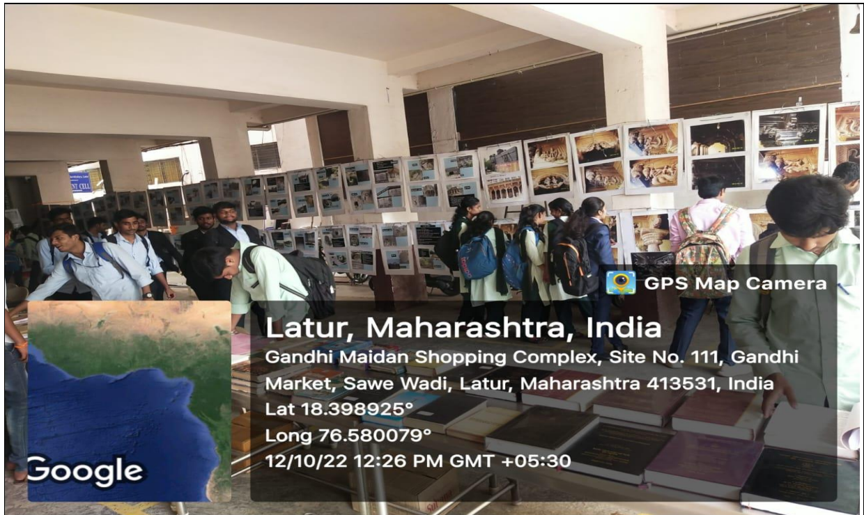
Students while visiting the exhibition