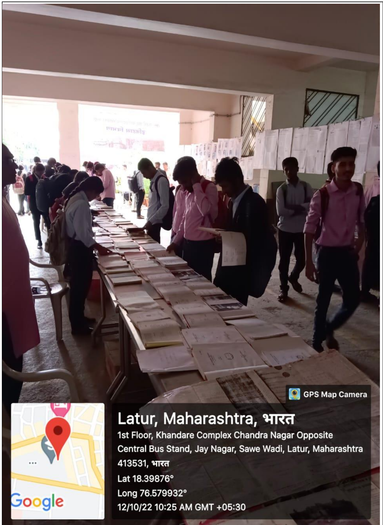
Students while visiting the exhibition