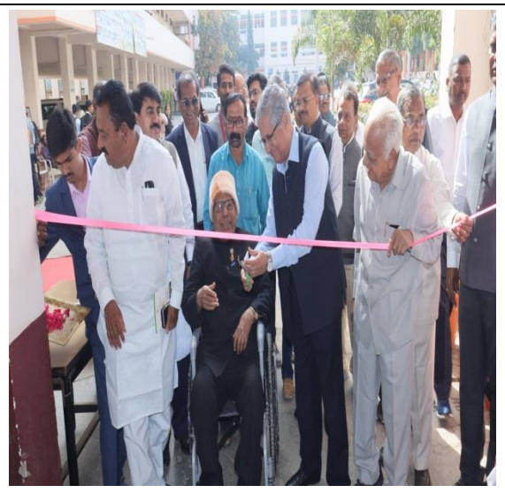
Inauguration of the Exhibition by Dr. Gopalrao Patil and dignitaries