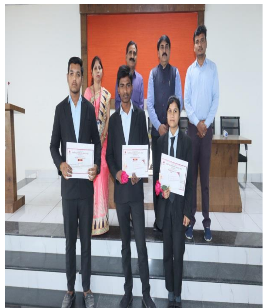
All winners including the dignitaries