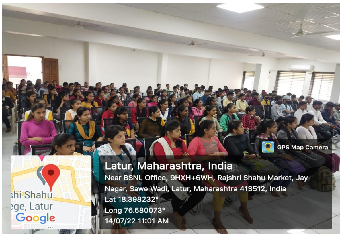
The students while attending the Program