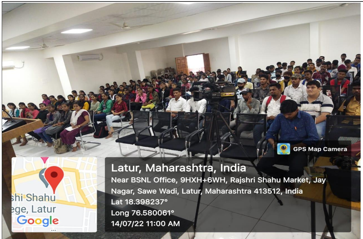
The students while attending the Program