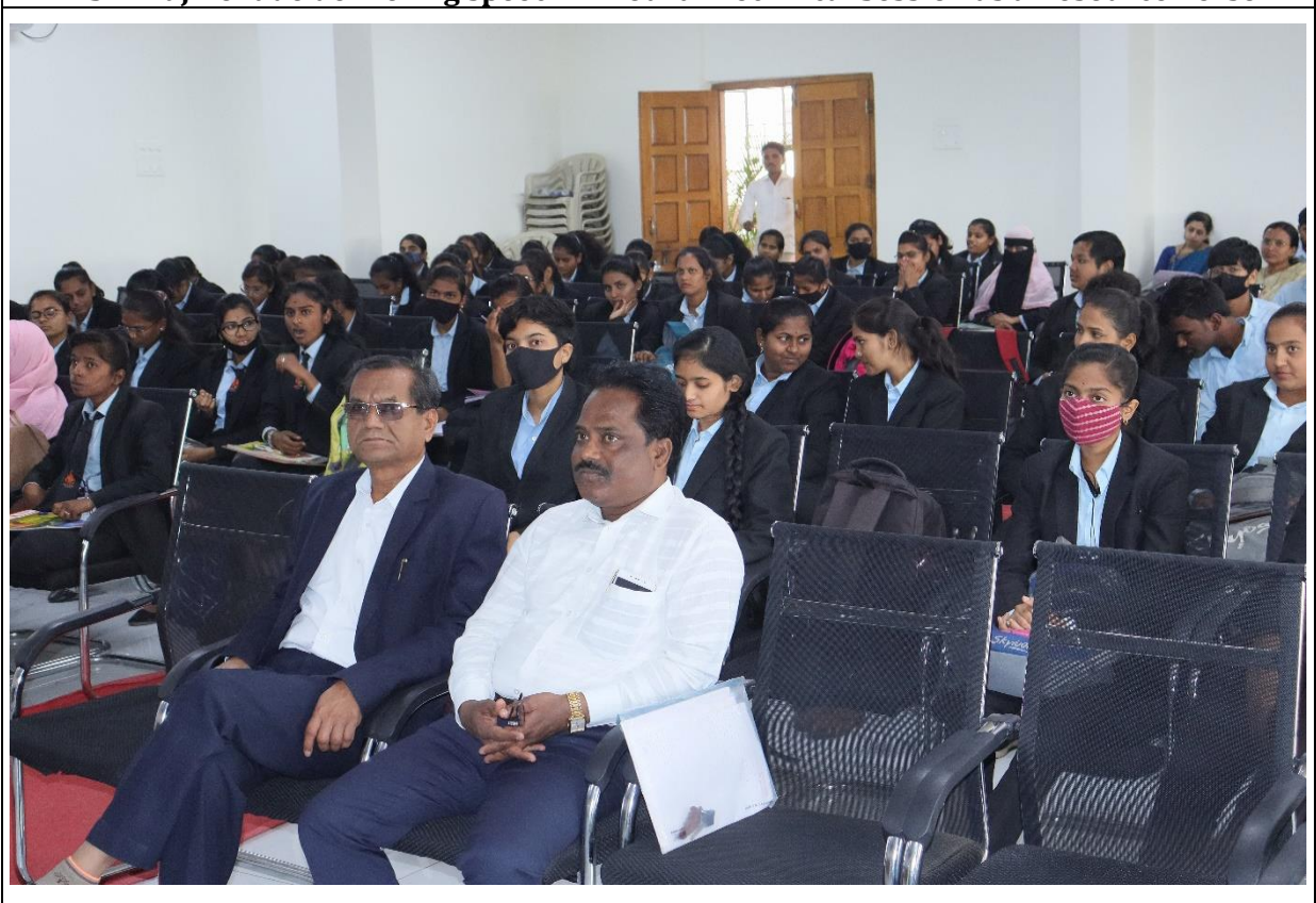
Delegates and students attending seminar