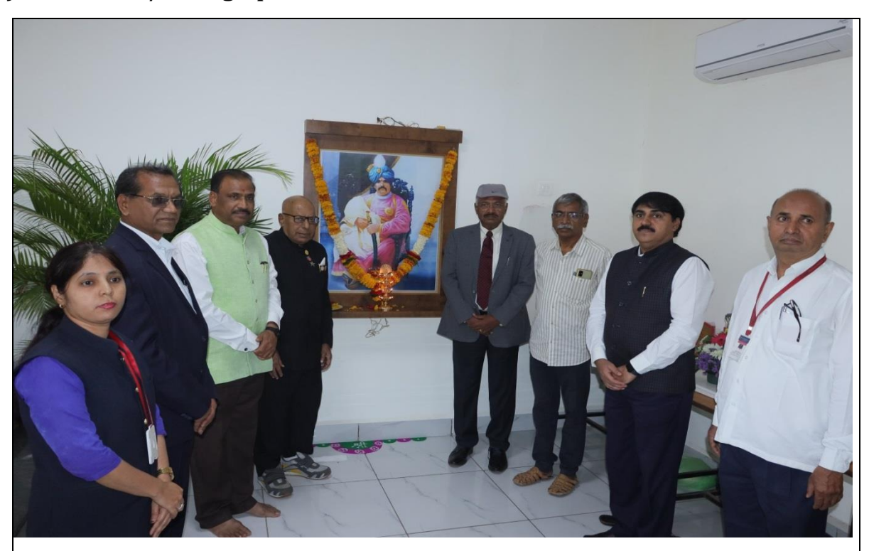
The dignitaries Inaugurate the seminar