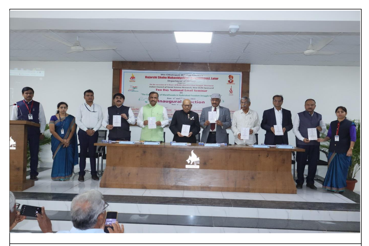
The Dignitaries releasing the Proceeding with ISBN No.