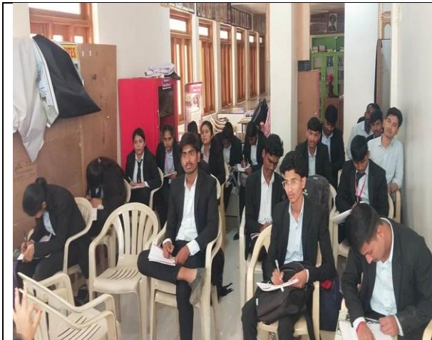
The Students while Participating in One Minute Show