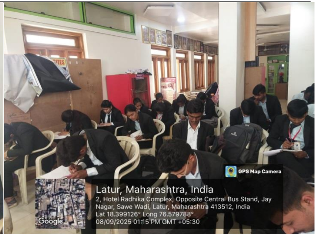
The Students while Participating in One Minute Show