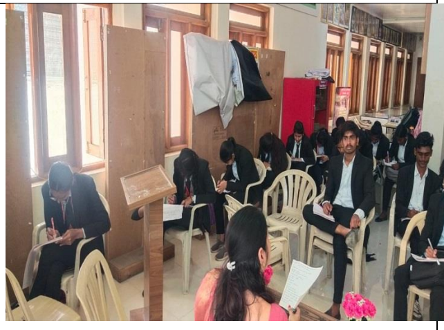
The Students while Participating in One Minute Show