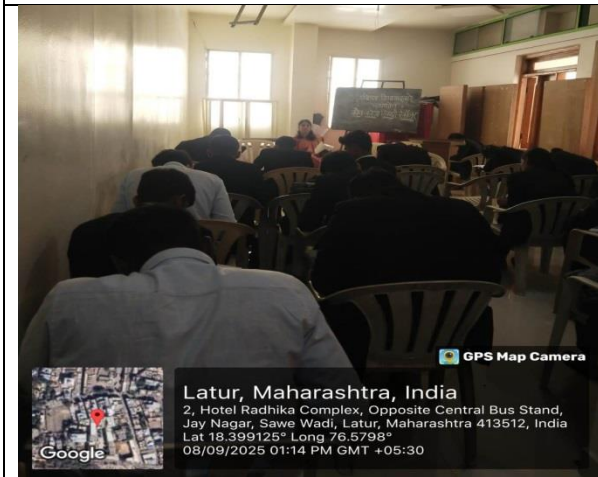
The Students while Participating in One Minute Show