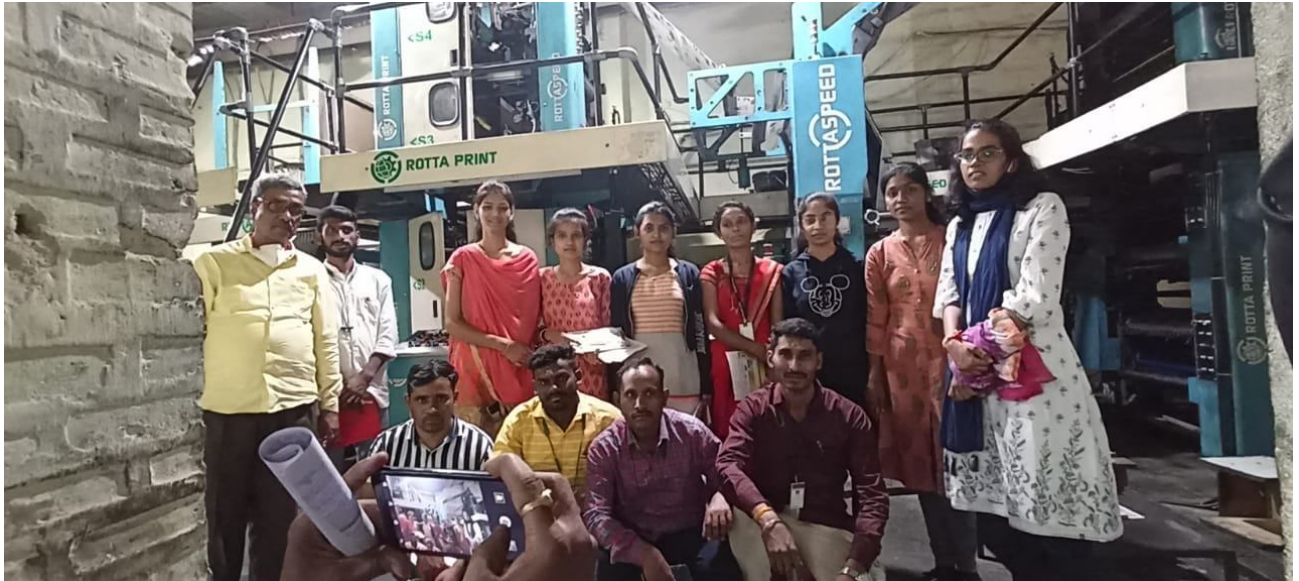
In Daily Tarun Bharat Printing Press