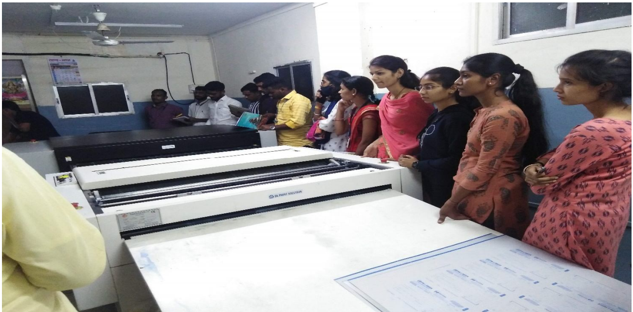
In Daily Tarun Bharat Printing Press