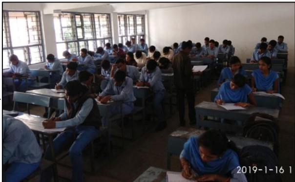
While participant students writing Essay.