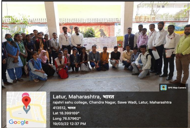
All Participants and Teachers