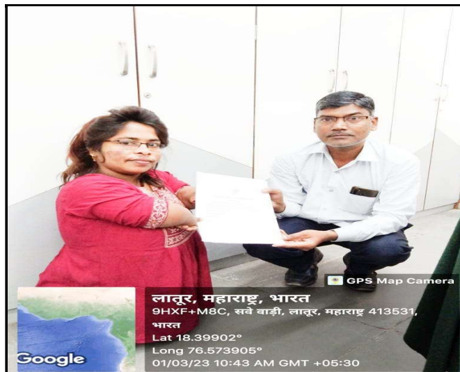
Students of Political Science with Latur city Administrative Officers