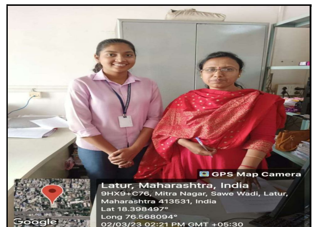
Students of Political Science with Latur city Administrative Officers