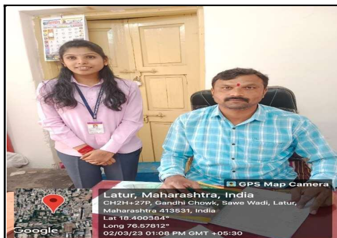
Students of Political Science with Latur city Administrative Officers