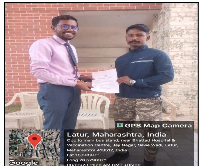
Students of Political Science with Latur city Administrative Officers