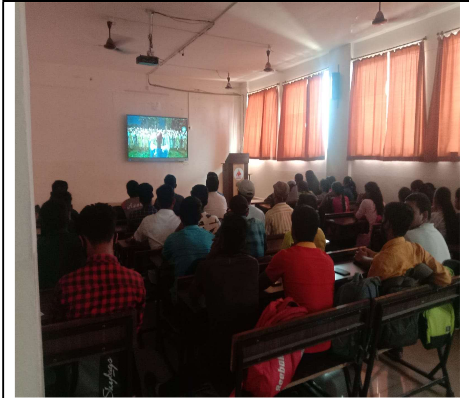
Student Watching Movie