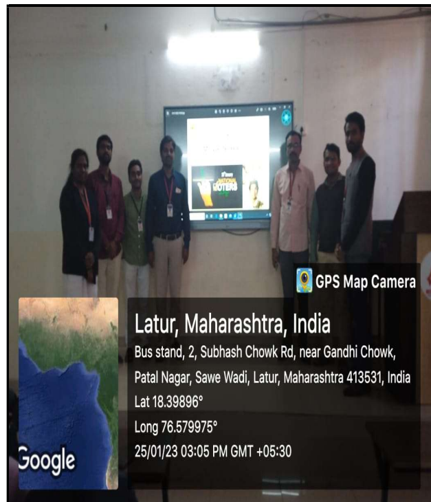
All Departmental Staff