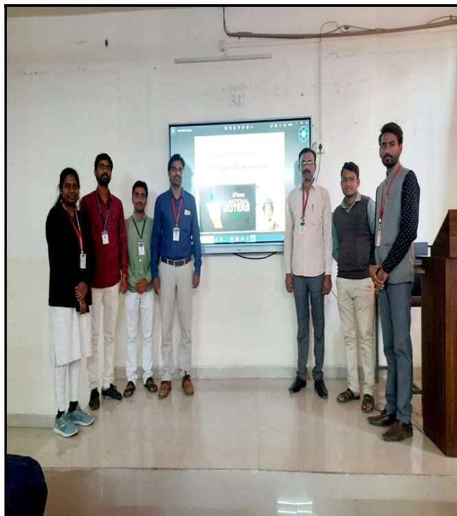
All Departmental Staff