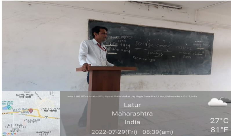
(B.C. Bokade Guiding to students in bridge course)