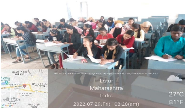
( Participants in Bridge Course)

D) Link of Video of the programme if any - NIL