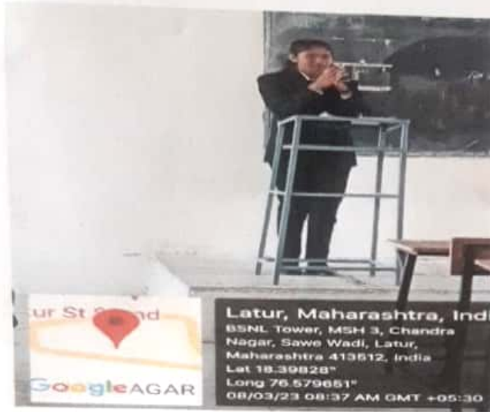
(Participant is giving seminar on International Women's Day)

D) Link of Video of the programme if any - NIL