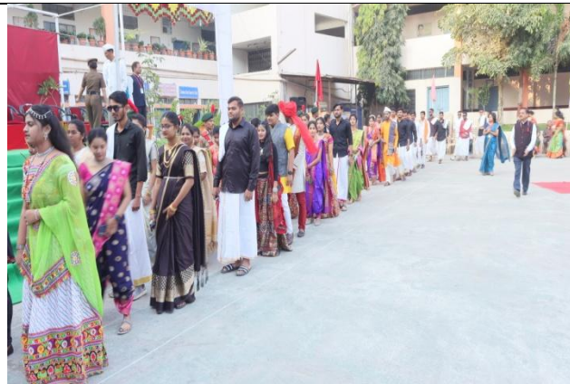
Presentation of IT Students on occasion of National Flag Hoisting Republic Day Date: 26/01/23