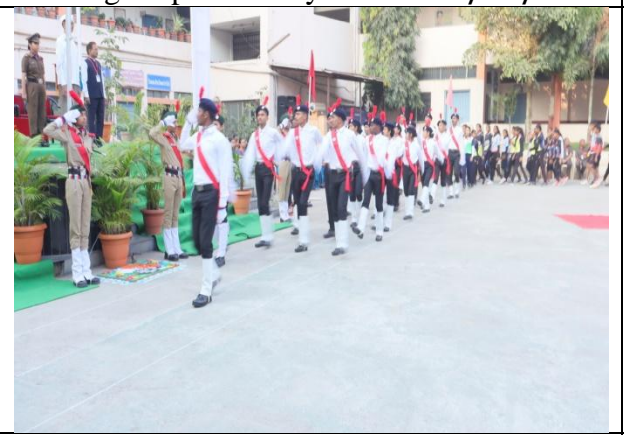
Presentation of NSS cadets on occasion of National Flag Hoisting Republic Day Date: 26/01/23