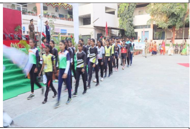
Presentation of students Sport Department on occasion of National Flag Hoisting Republic Day Date: 26/01/23