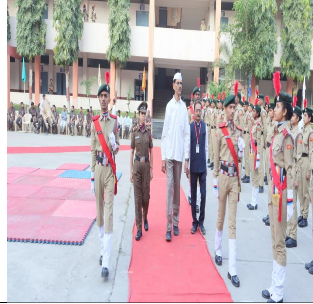
N.C.C. cadets piloting Chief Guest on occasion of National Flag Hoisting Republic Day Date: 26/01/23