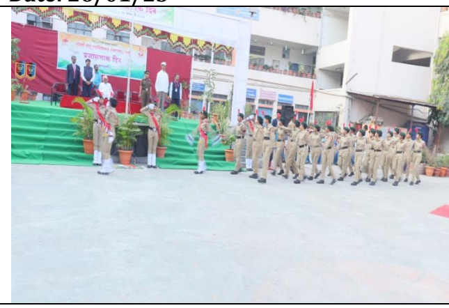
Presentation of NCC cadets on occasion of National Flag Hoisting Republic Day Date: 26/01/23