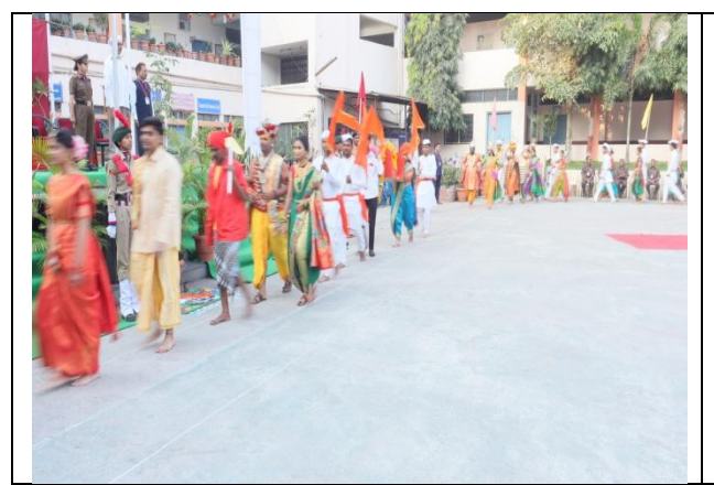
Presentation of CEP Students on occasion of National Flag Hoisting Republic Day Date: 26/01/23