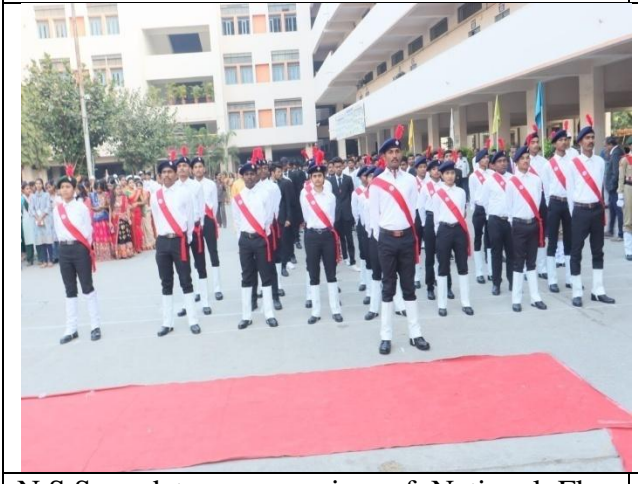
N.S.S. cadets on occasion of National Flag Hoisting Republic Day Date: 26/01/23

and Staff members present for flag hoisting Date: 26/01/23