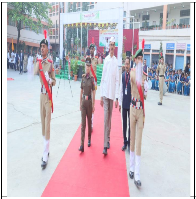
N.C.C. cadets piloting Chief Guest on occasion of National Flag Hoisting Republic Day Date: 26/01/23