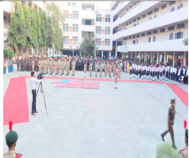
Staff members, N.C.C. cadets, N.S.S. cadets and students present for flag hoisting Date: 26/01/23