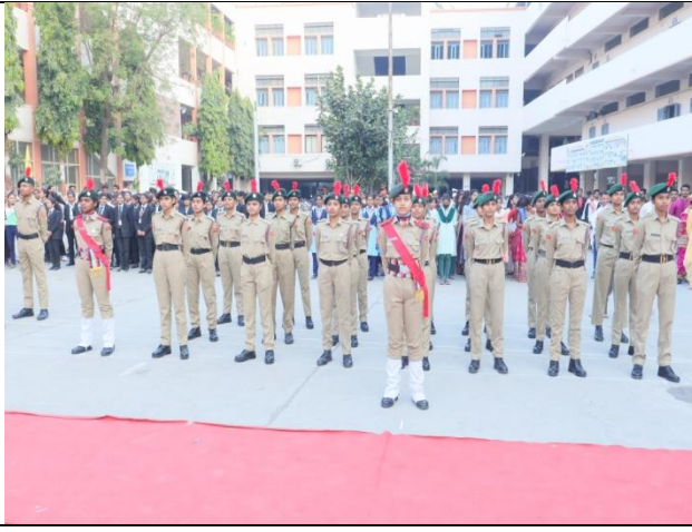
N.C.C. cadets on occasion of National Flag Hoisting Republic Day Date: 26/01/23