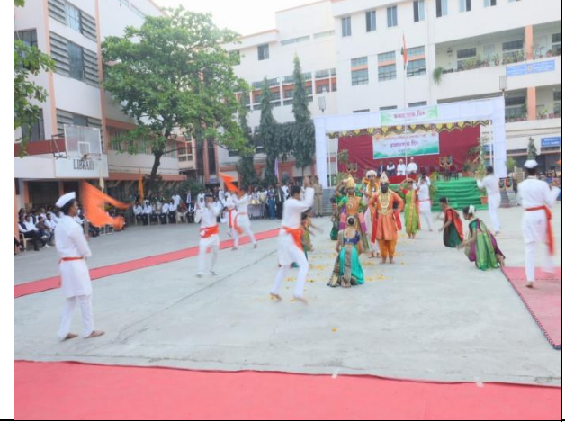
Presentation of CEP Students Dindi on occasion of National Flag Hoisting Republic Day Date: 26/01/23

D) Link of Video of the programme if any: Nil