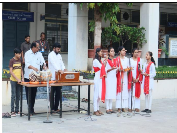
Music Department Maharashtra Geet and National Anthem. On occasion of Maharashtra Day Celebration. Date: 01/05/23