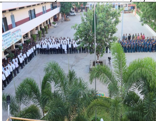
All Staff members present for Flag Hoisting on occasion of Maharashtra Day Celebration. Date: 01/05/23