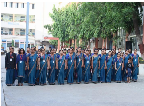
Ladies Staff members present for Flag Hoisting on occasion of Maharashtra Day Celebration. Date: 01/05/23