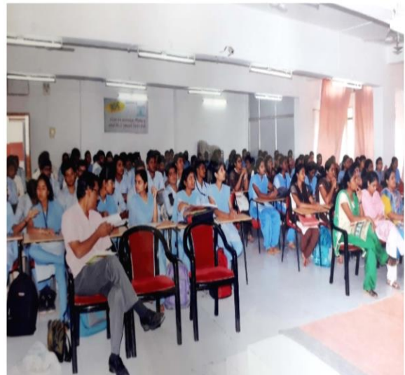
Attendees of the Programme