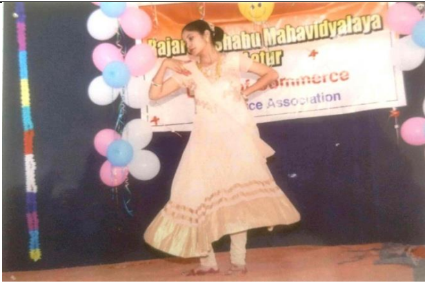
One of the participant while dancing