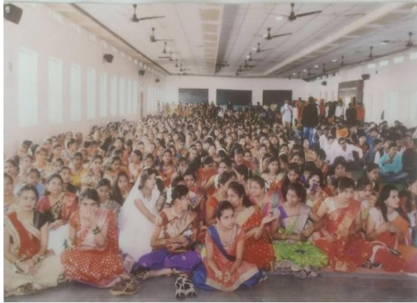
Attendees of the programme