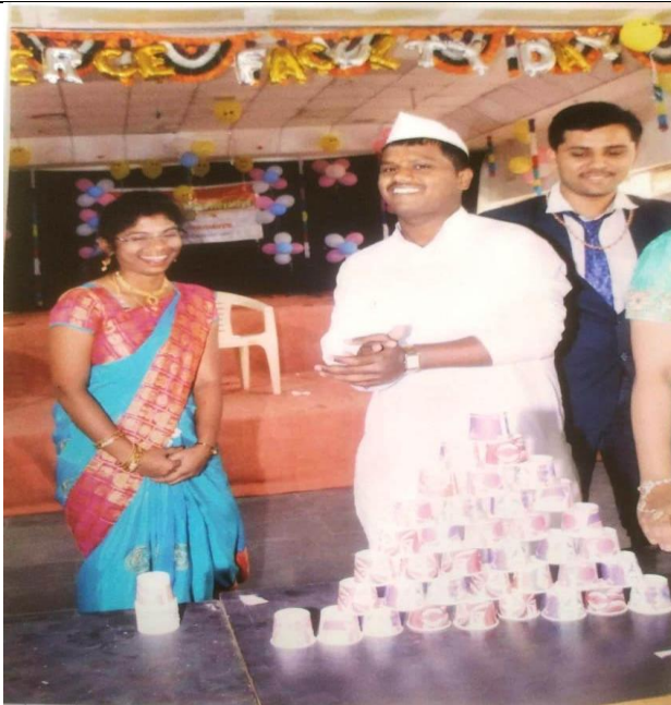
Games organized in the programme