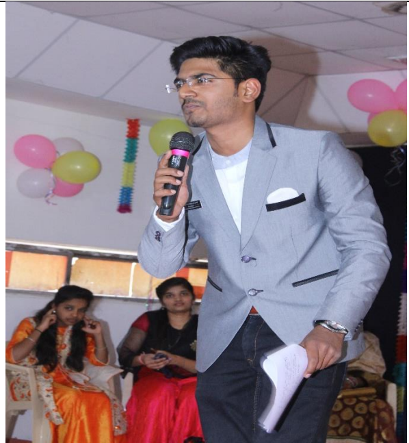
Anchoring by student