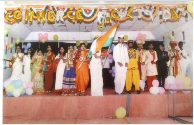
Glimpses of Programme