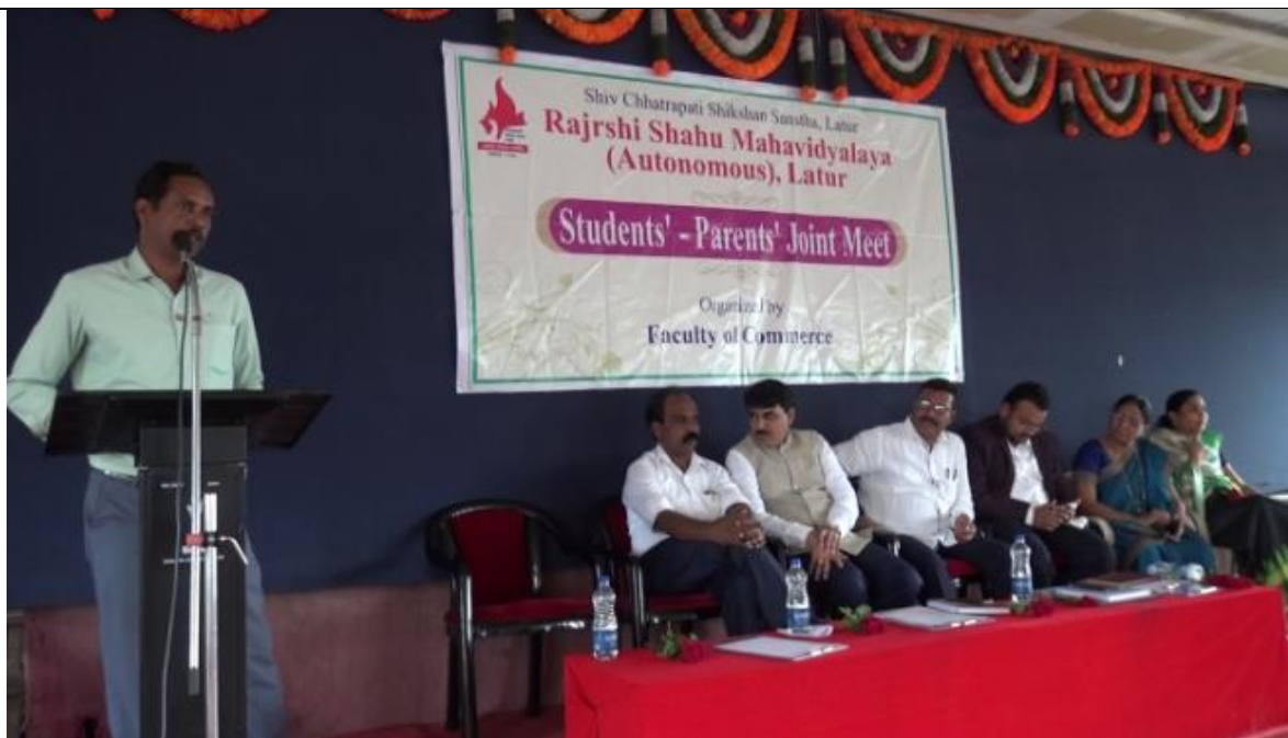
One of the parents sharing his views