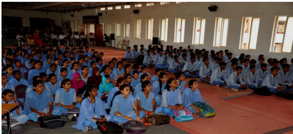
Students carefully listening to resource person