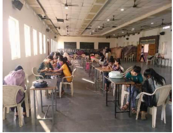
Students enthusiastically participated in the Mehendi Competition Dated on 1.2.2021