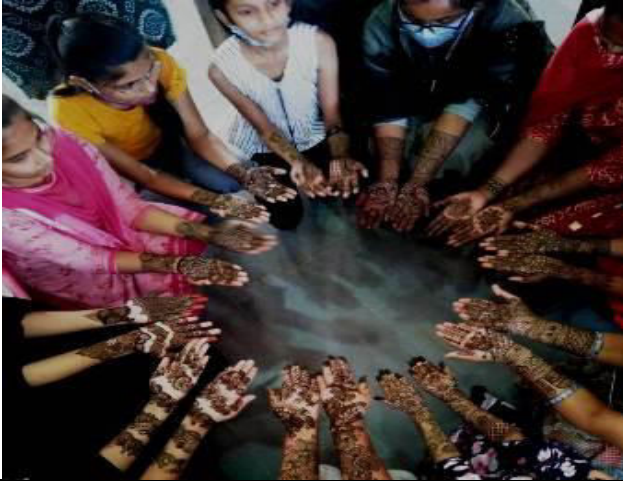
Department of Commerce Organized Mehendi Competition Dated on 1.2.2021