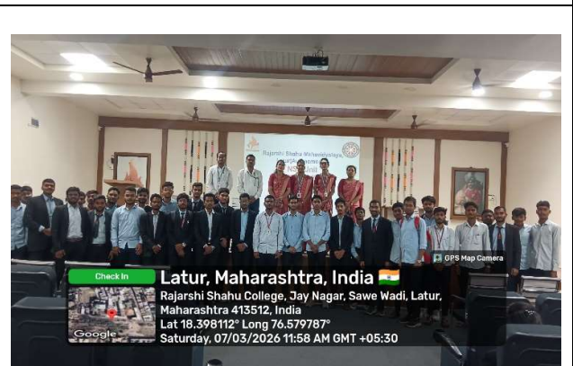
Glimpses of Program