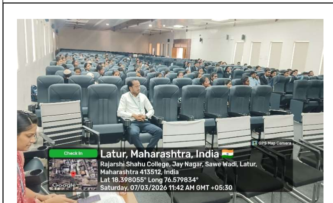
Attendees of Program