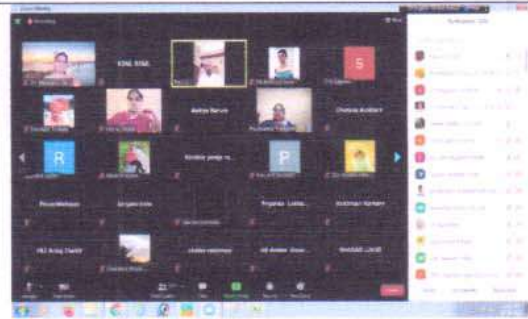
Glimps of workshop on Financial Literacy