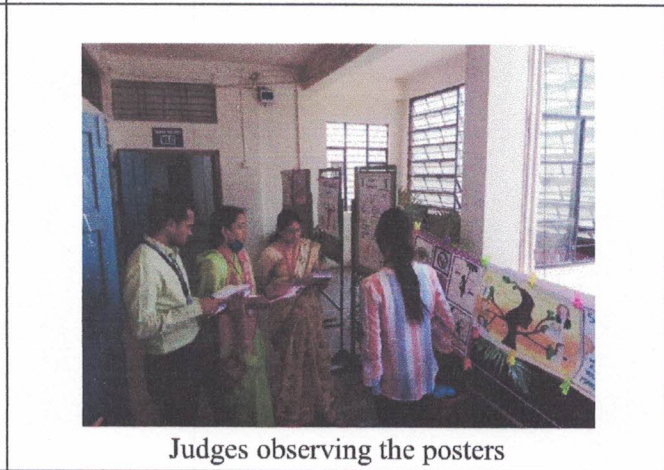
Judges observing the posters