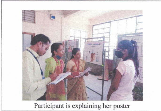
Participant is explaining her poster