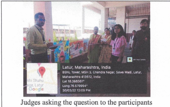
Judges asking the question to the participants