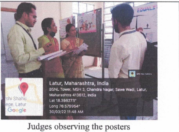
Judges observing the posters