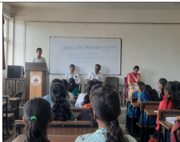
Student while giving speech in Elocution Competition