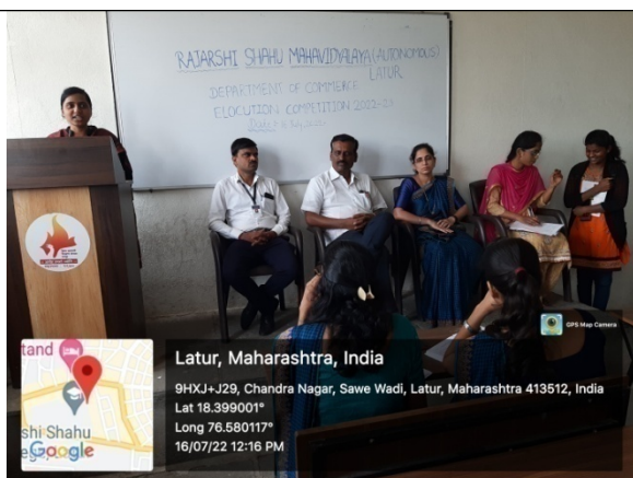
Student while giving speech in Elocution Competition