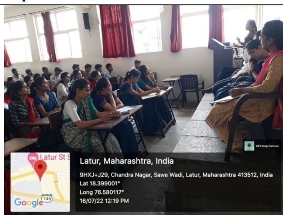
Attendees of Elocution Competition