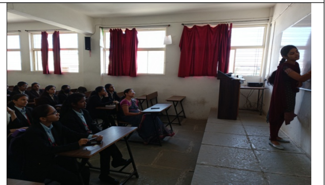
Students attending the programme