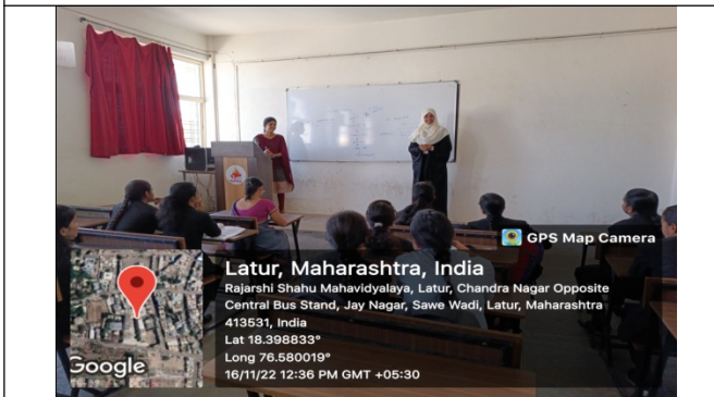
Student discussing with the resource person