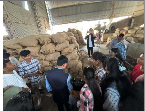
Students observing the processing of rice.