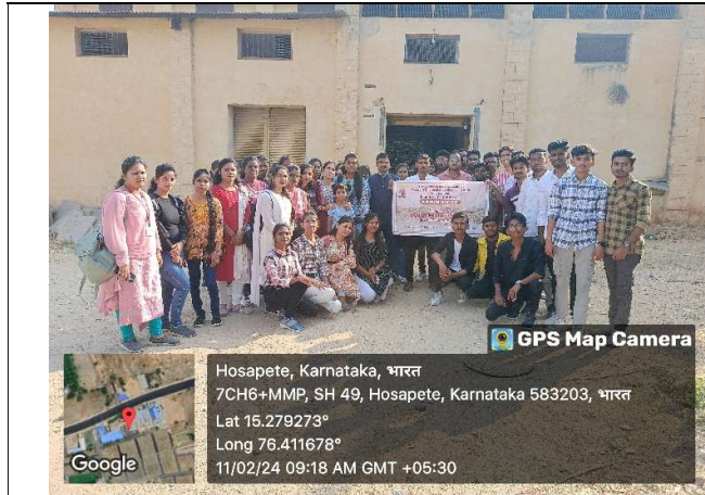
Industrial Visit to HOSPET