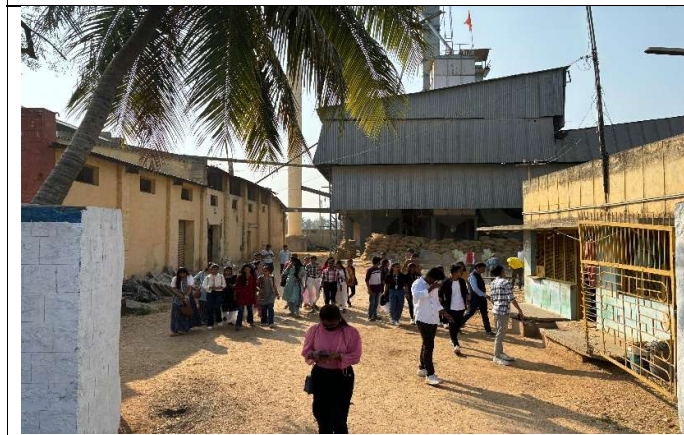
View of Industrial Site