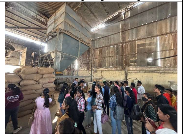
Student exploring mill processing

D) Link of Video of the programme if any