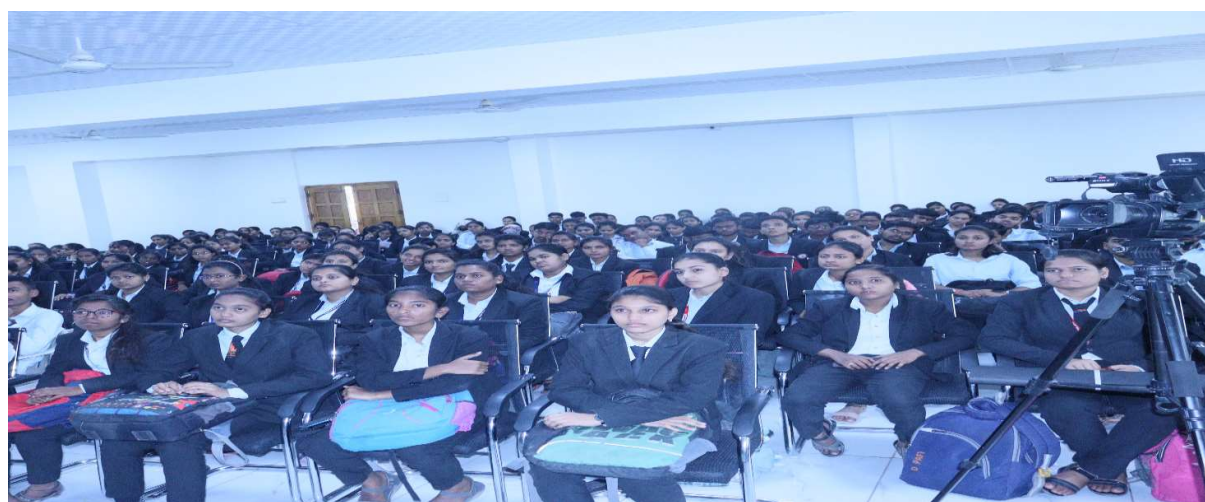
Attendees of the Program

D) Link of Video of the Programme if any