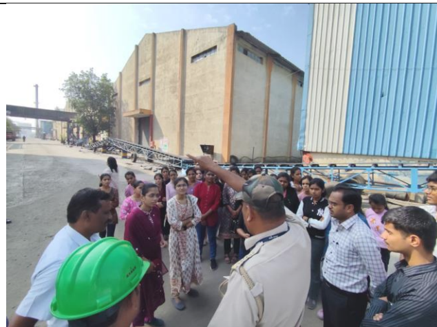
Student exploring industry processing

D) Link of Video of the programme if any