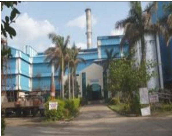
View of Industrial Site