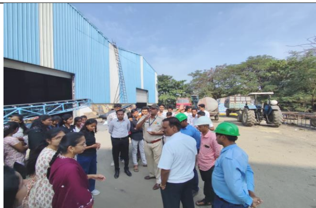
Students observing the processing of sugar.