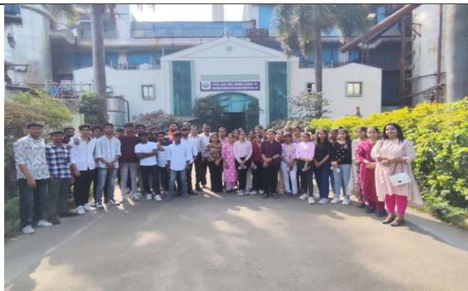
Industrial Visit to Ranjani