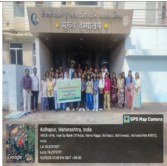
Group photo of Faculty & students at Warana Milk, Kolhapur