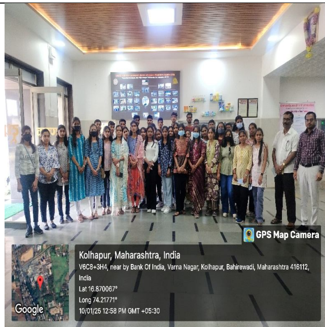
Group photo of Faculty & students at Warana Milk, Kolhapur