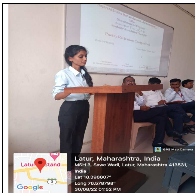
Student reciting poems in Poetry Recitation Competition