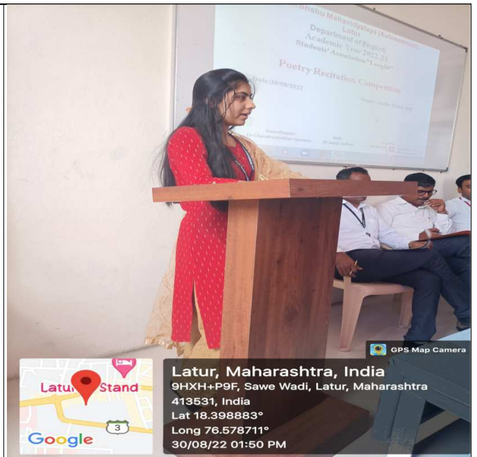
Student reciting poem in Poetry Recitation Competition