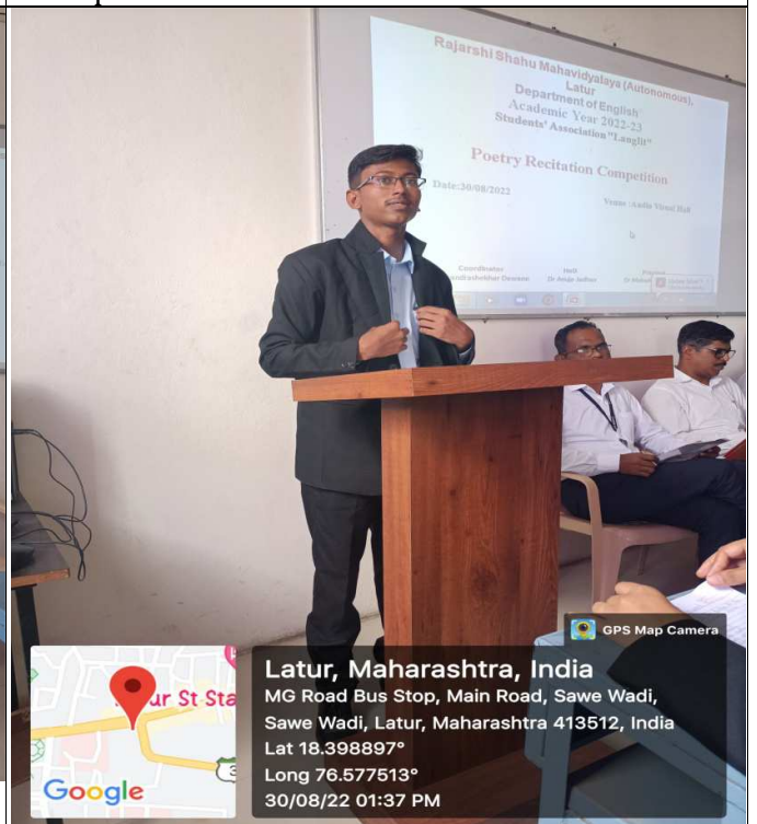
Students reciting poems in Poetry Recitation Competition