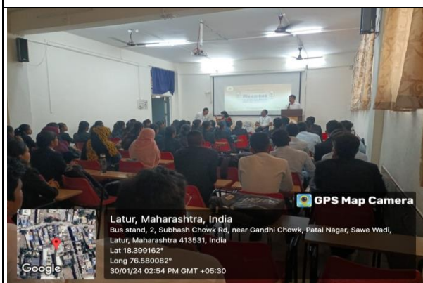
Students listening to the resource person