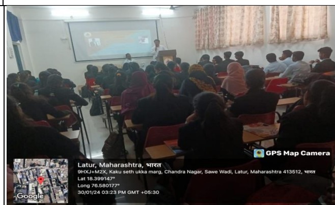
Students listening to the resource person