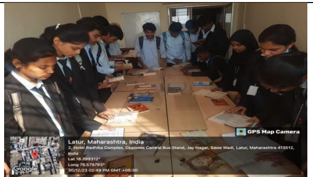
Students while reading the books.