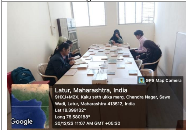
Students while reading the books.