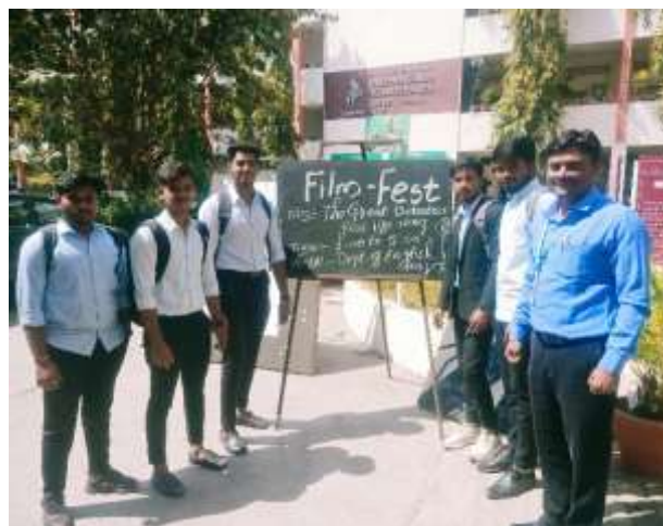
Film fest notice board and students