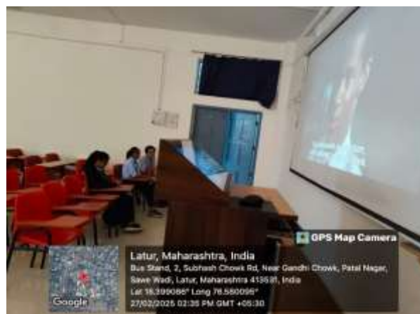
Film fest in Visual lab