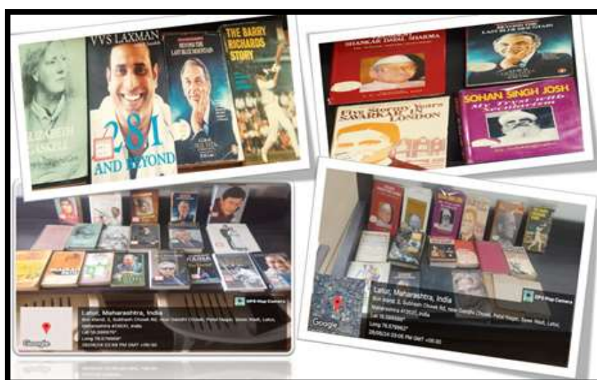
Books from the library session – “Biography and Autobiography”