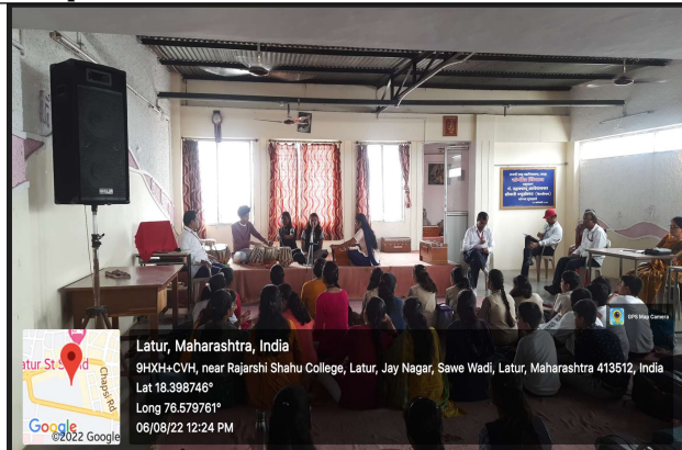
Students presenting a Sanskrit Song during the Competition.