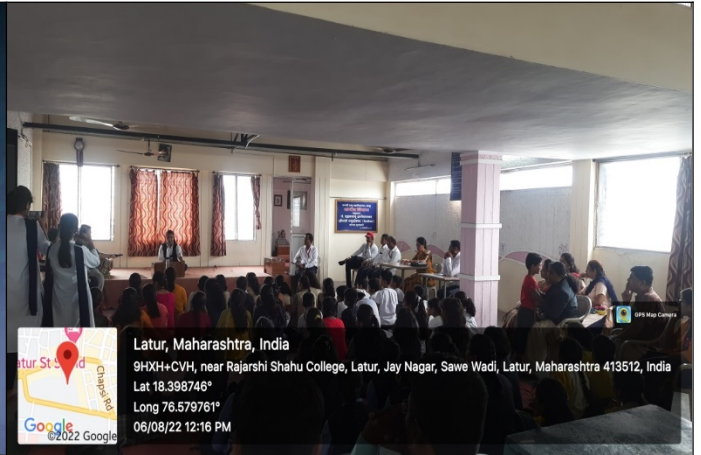
Student presenting a Sanskrit Song during the Competition