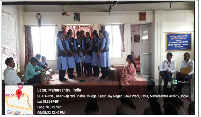
Student presenting a Sanskrit Song during the Competition.