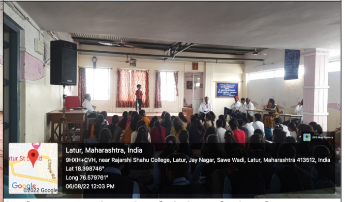
Student presenting a Sanskrit Song during the Competition.