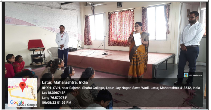
Supervisor announcing the result and addressing the students.