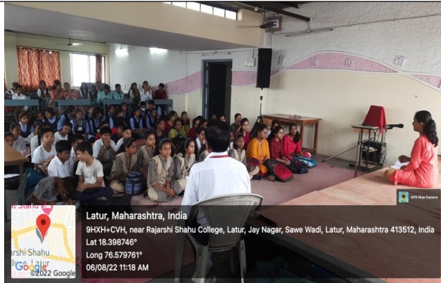
Student presenting a Sanskrit Song during the Competition.