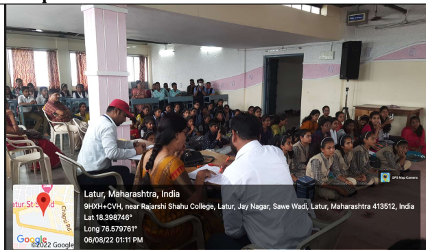
Supervisor preparing the result by looking at the marks of the participants.